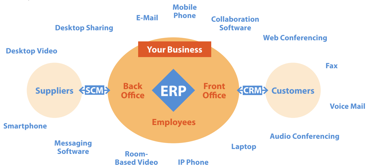
Exhibit 1: Unified Communications in the Extended Enterprise

To allow users in extended organizations to communicate, collaborate and share content with each other, organizations have deployed a variety of applications (see Exhibit 1). So far, however, organizations have not reached their full potential. Today’s collaboration methods are still too difficult at a time when effective, real-time collaboration is critical to the business.